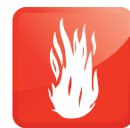
fire rated (joint widths >50mm)