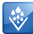
BFG water gutter