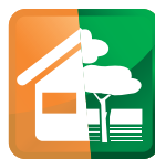
indoor & out- door use