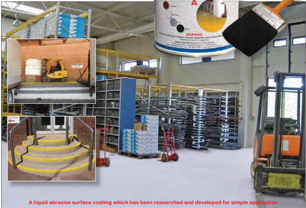
A liquid abrasive surface coating which has been researched and developed for simple application

Slip resistant testing information for SAF-T can be found on page 54.