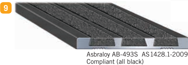
Asbraloy AB-493S AS1428.1-2009 Compliant (all black)