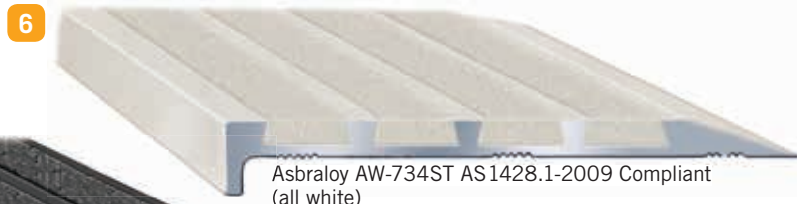
Asbraloy AW-734ST AS1428.1-2009 Compliant (all white)