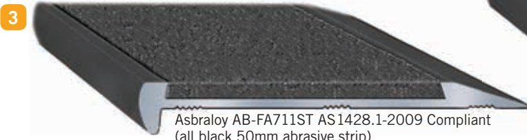
Asbraloy AB-FA711ST AS1428.1-2009 Compliant (all black 50mm abrasive strip)