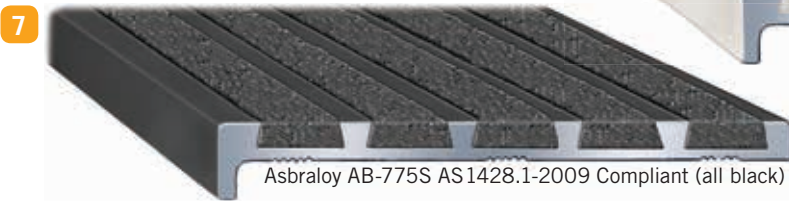
Asbraloy AB-775S AS1428.1-2009 Compliant (all black)