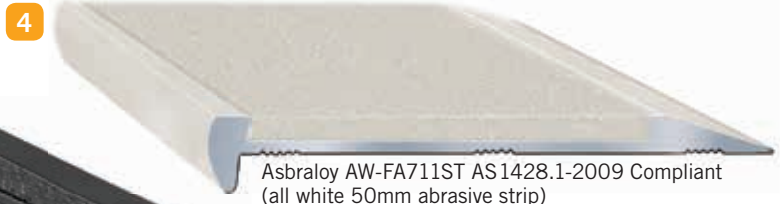
Asbraloy AW-FA711ST AS1428.1-2009 Compliant (all white 50mm abrasive strip)