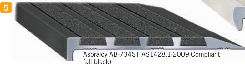
Asbraloy AB-734ST AS1428.1-2009 Compliant (all black)