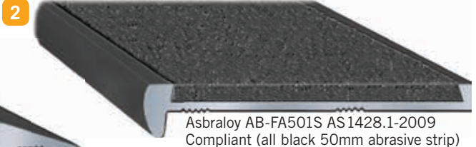
Asbraloy AB-FA501S AS1428.1-2009 Compliant (all black 50mm abrasive strip)