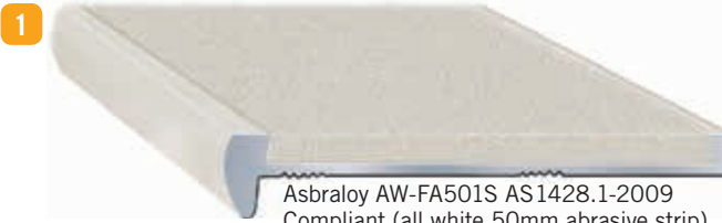
Asbraloy AW-FA501S AS1428.1-2009 Compliant (all white 50mm abrasive strip)