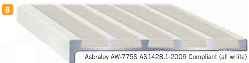
Asbraloy AW-775S AS1428.1-2009 Compliant (all white)